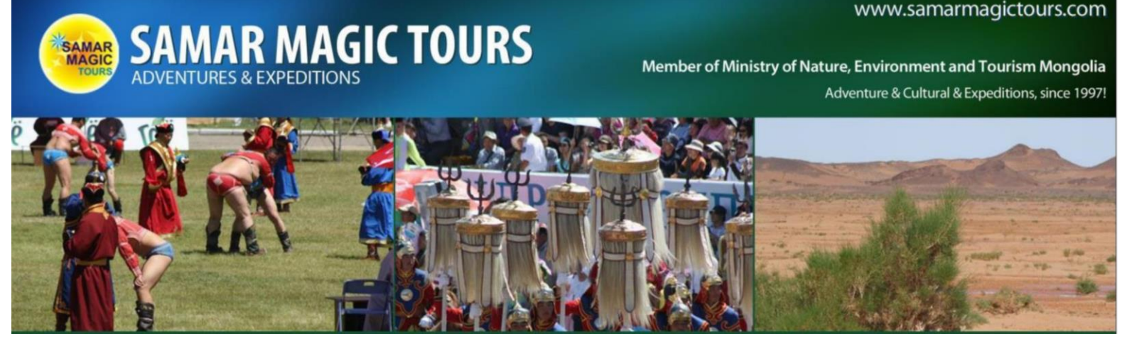
• The Mongolian National Wrestling: This spectacular event takes place in the Central Stadium. There